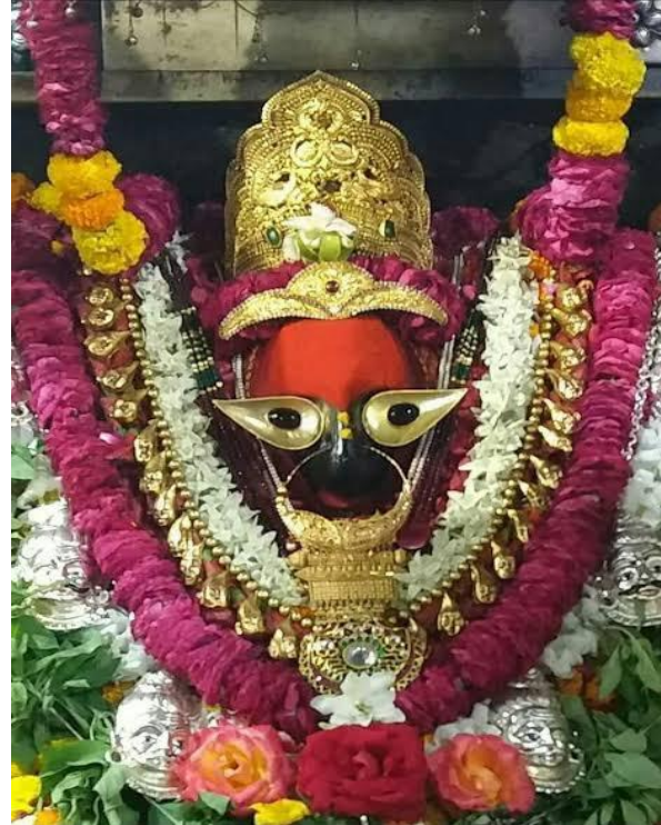
Pic: 03 Vindhyachal Devi Shakthipeeth