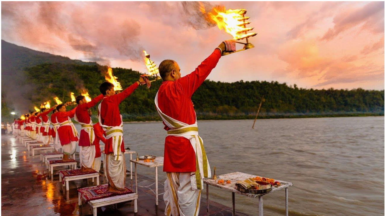
Pic: 01 Ganga Arati

Assemble at Coimbatore airport by early morning 0430 hrs. 0630 hrs departure to Varanasi via Chennai. Arrival at Varanasi Airport by afternoon 2 PM. On arrival Pickup and transfer to the hotel. Lunch at restaurant. Proceed to hotel and complete the check in formalities. 4.30 PM proceed to city Tour of Varanasi visit New Vishwanath Temple Banaras Hindu University, Sankat Mochan Temple, Tulsi Manas Mandir, Durga Mandir, Tridev Temple. In evening Ganga Aarti with Boat ride (Direct Payment on your own) at Main Ghat. Night dinner & Overnight stay at Varanasi hotel.