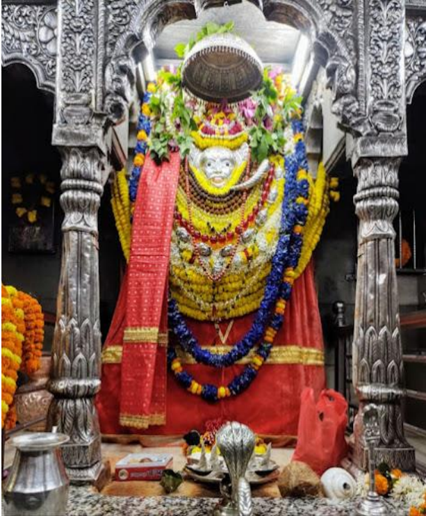
Pic: 02 Kaal Bhairav